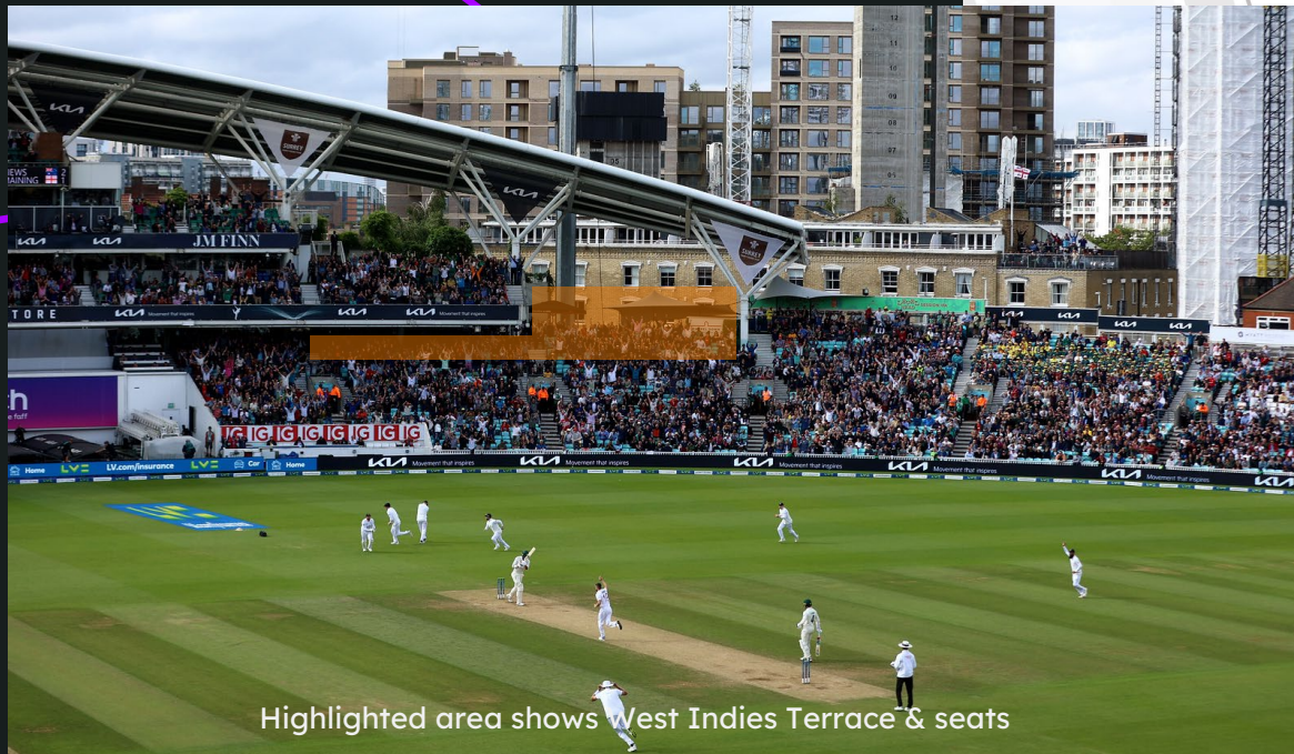
Highlighted area shows West Indies Terrace & seats